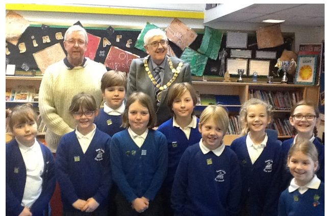
Two local councilors visited to hear about our fabulous Eco Warriors